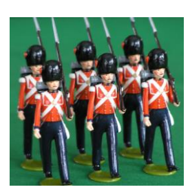
The March of the ure Toy Soldiers